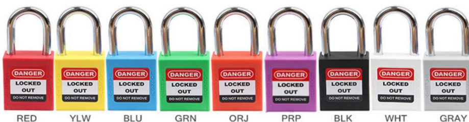
RED YLW BLU GRN ORJ PRP BLK WHT GRAY